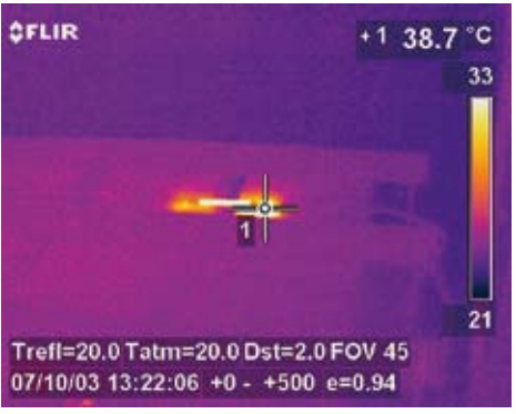
Visual and infrared image of a trip and supply panel.