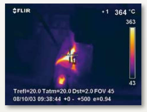
Visual and infrared image of a diesel generator.